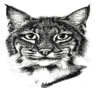
College/Santa Ynez School