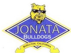
Jonata Middle School, Buellton